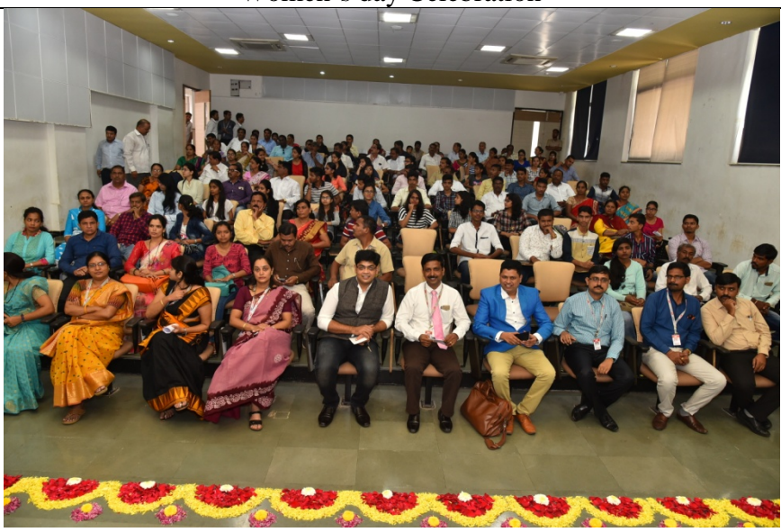
Teacher Parent Interactions