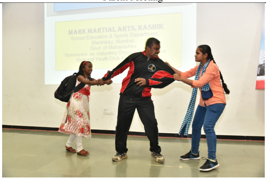
Self Defense Workshop