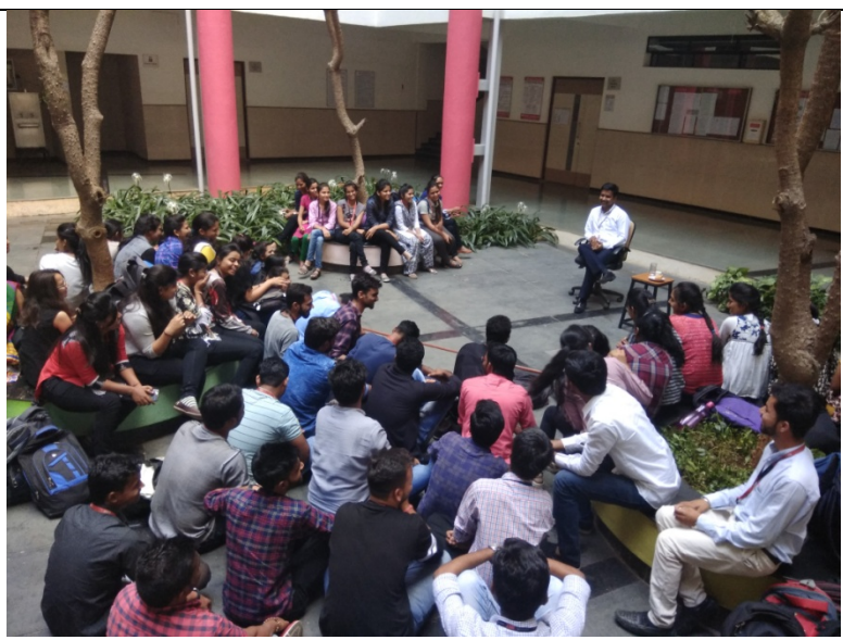
Chai Pe Charcha: Open Forum for Students