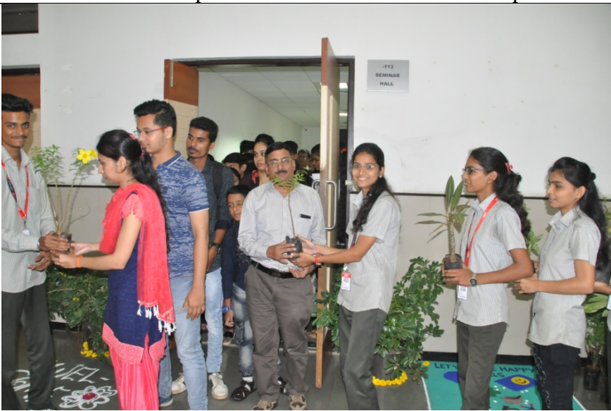
Parent Meet, Plant Distribution

Women Empowerment: Self Defense Workshop