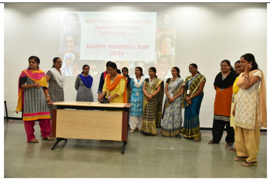
Women's day Celebration