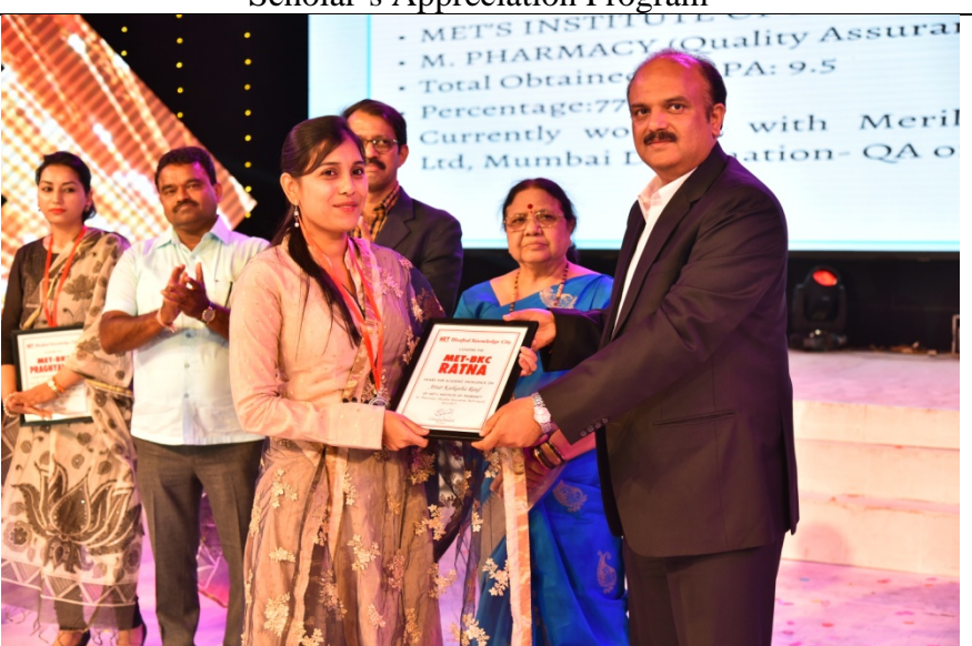
Scholar's Appreciation Program